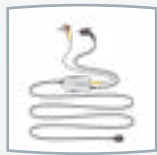
55" probe extension