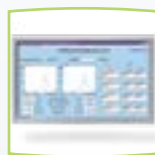
MAICO PC software